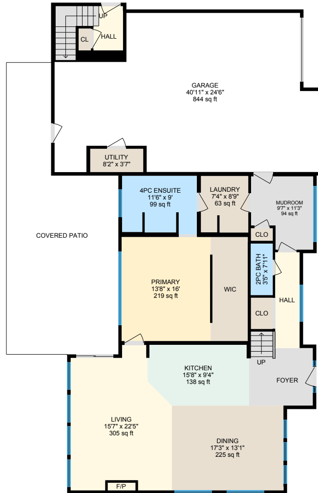
Main Floor Exterior Area 1741.78 sq ft

Main Building: Total Exterior Area Above Grade 3698.27 sq ft