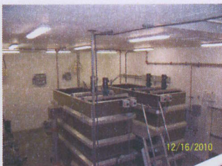
Direct Filtration Sand Filters