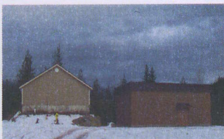
Reservoir and Water Treatment Plant

"...one of the most advanced and environmentally friendly water treatment plants in the province..."