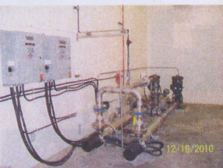
New Ultra Violet Disinfection Units

For more information, contact the CSRD at 781 Marine Park Drive NE PO Box 978 Salmon Arm BC V1E 4P1 Phone (250) 832-8194 or 1-888-248-2773 toll-free. Fax (250) 832-1083 Website www.csr.bc.ca